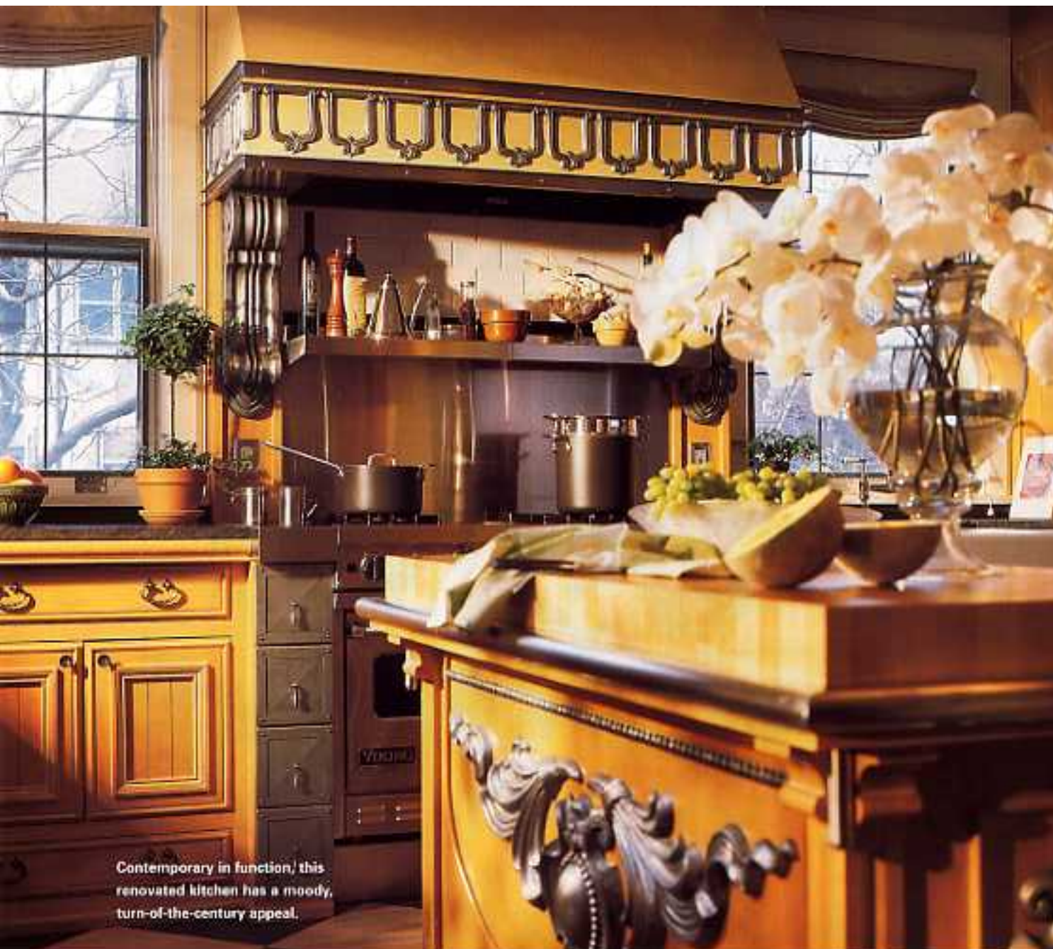
Contemporary in function, this renovated kitchen has a moody, turn-of-the-century appeal.