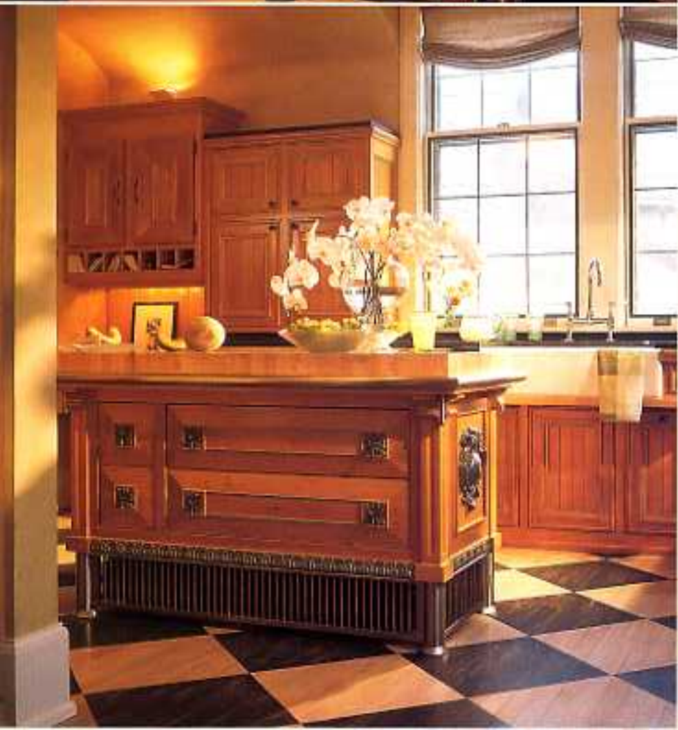
ILLUSTRATION: SHARON COOK

TOP LEFT: Kitchen cabinets—maple, with a whitewash in the crevices—are designed as free-standing furniture. Setting wall cabinets on the counter and eliminating toe space at the base asserts the idea of furniture rather than a built-in. BOTTOM LEFT: A radiator at the room's center is hidden by the metal grate at the island's base. BELOW: Leaded glass on the hutch's doors mimic that found elsewhere in the house.